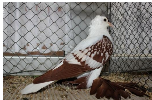
Saxon Fairy Swallow red spangled Jürgen Noll, V 97 SVB