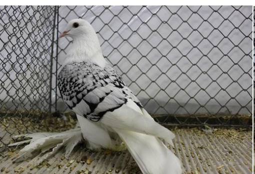
Saxon Shield black spangled Gottfried Oertel, hv 96 E