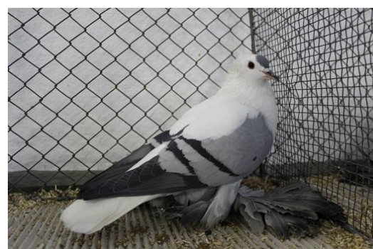
Saxon Fairy Swallow blue black bars Klaus Dieter Müller, V 97 SVB