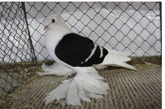
Saxon Shield double crested black white bars Reinhard Rothe, V 97 E-Ged.