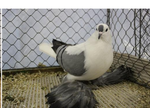
Saxon Silesian Swallow blue black bars Leo Kunath, V 97 SVB