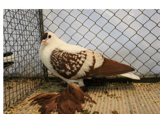
Saxon Silesian Swallow red spangled Heinz Mosig, hv 96 EP