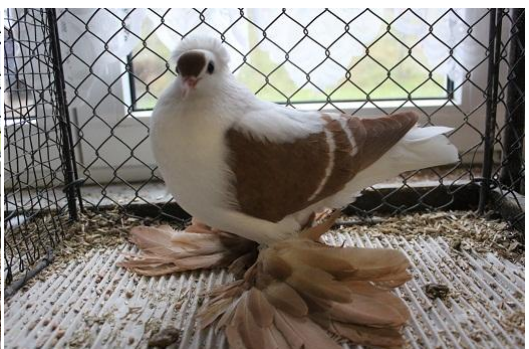
Saxon Fairy Swallow yellow white bars Klaus Burkhardt, hv 96 EP1