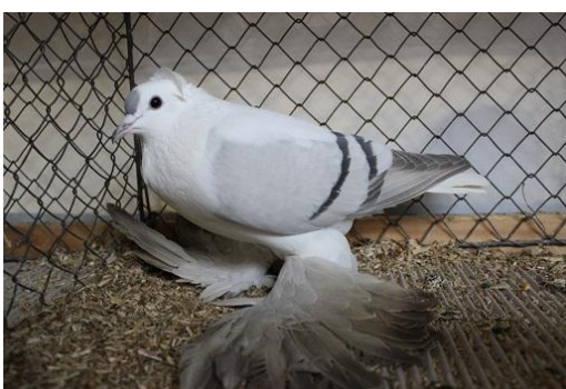
Saxon Fairy Swallow silver Klaus Dieter Müller, V 97 EKB