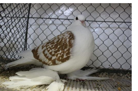
Saxon Shield yellow spangled Werner Grund, V 97 LVE