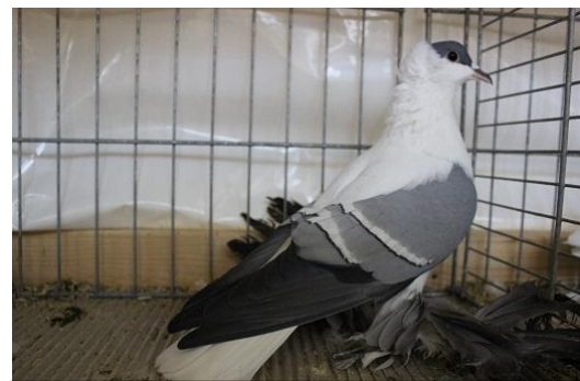
Saxon Fullhead blue white bars Martin Elze, V 97 EKB