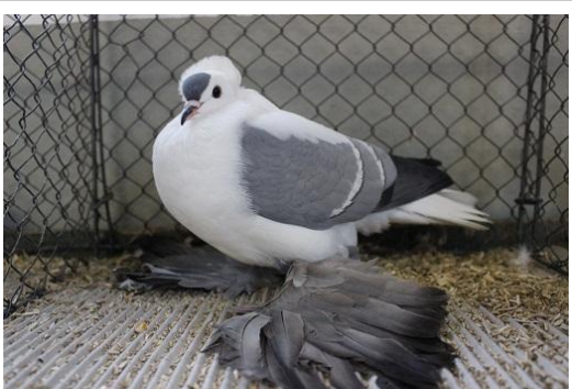
Saxon Fairy Swallow blue white bars Klaus Burkhardt, V 97 SVB