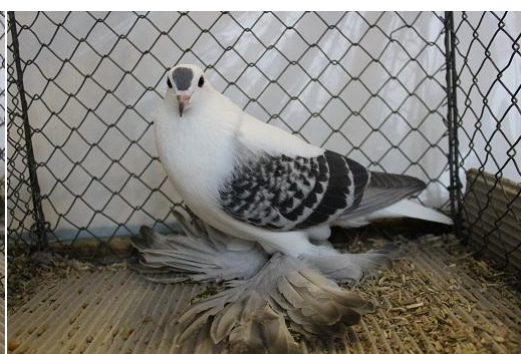
Saxon Silesian Swallow silver checker Kurt Melzer, hv 96 E