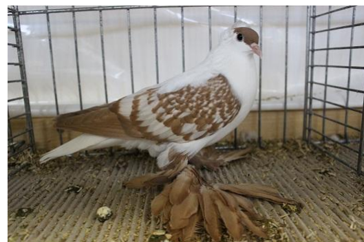
Saxon Fullhead yellow spangled Klaus Hentschel, hv 96 E