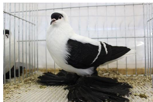
Saxon Fullhead black white bars Klaus Hentschel, V 97 BVE