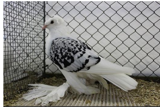
Saxon Shield double crested black spangled Horst Schmidt, V 97 SVB