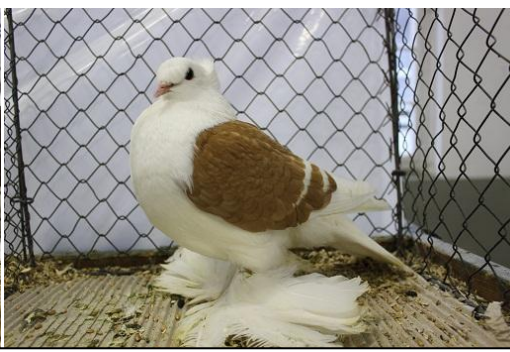
Saxon Shield double crested yellow white bars Louis Verelst, sg 95 E