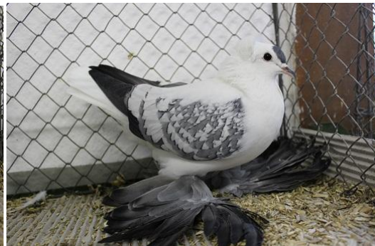
Saxon Fairy Swallow blue spangled Christoph Klemm, hv 96 EP