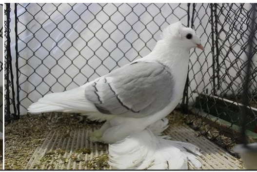
Saxon Shield double crested silver white bars Peter Stolze, sg 95 RZ