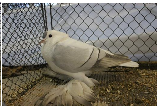
Saxon Silesian Swallow silver white bars Christoph Klemm, hv 96 E