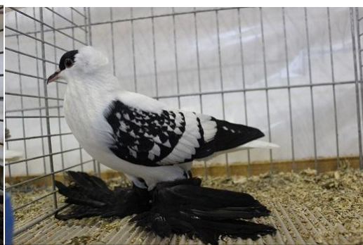
Saxon Fullhead black spangled Klaus Hentschel, hv 96 E