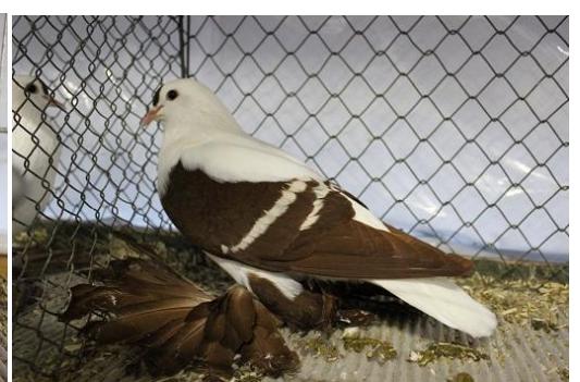
Saxon Silesian Swallow red white bars Gert Melzer, hv 96 E