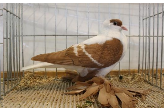
Saxon Fullhead yellow white bars Klaus Hentschel, V 97 E