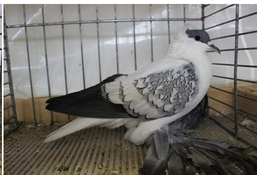
Saxon Fullhead blue spangled Martin Elze, V 97 EP