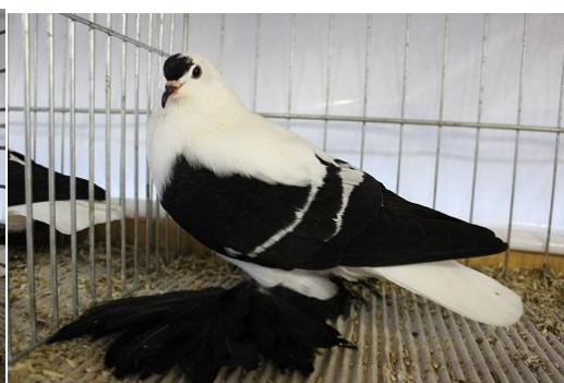
Saxon Silesian Swallow black white bars Jürgen Noll, V 97 SVB