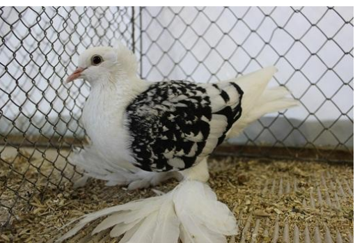
Saxon Shield crested black spangled Wilfried Metzner, sg 95 E