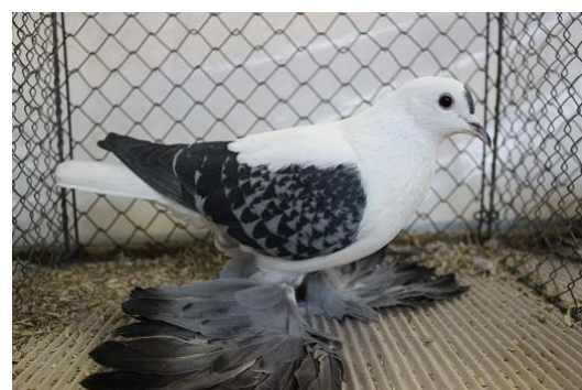
Saxon Silesian Swallow blue checker Dieter Junghänel, hv 96 LVEM