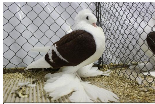
Saxon Shield double crested red white bars Reinhard Rothe, V 97 SVB