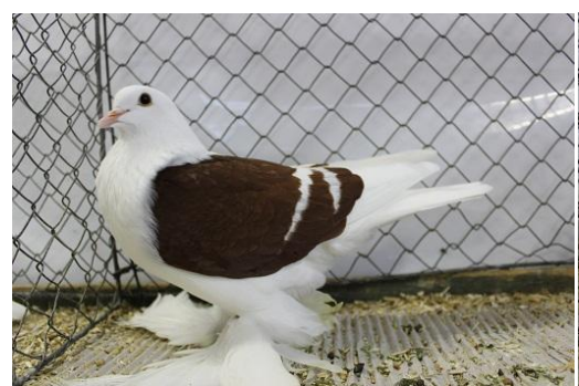
Saxon Shield red white bars Andreas Reuter, hv 96 LVE