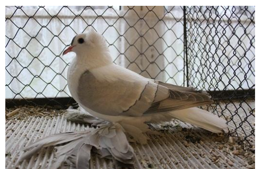
Saxon Fairy Swallow silver white bars Kurt Melzer, hv 96 KVE