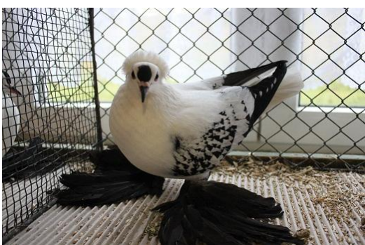
Saxon Fairy Swallow black spangled Horst Schmidt, V 97 SVB