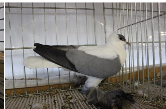
Saxon Fullhead blue barless H.-Ulrich Lemnitz, hv 96 E