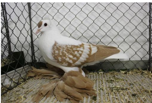
Saxon Fairy Swallow yellow spangled Klaus Burkhardt, V 97 SVB