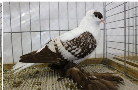
Saxon Fullhead red spangled Klaus Hentschel, V 97 SVB