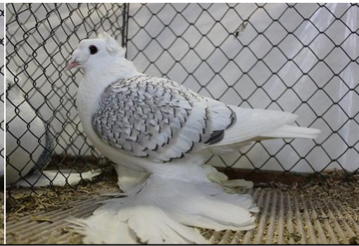
Saxon Shield double crested silver spangled Reinhard Rothe