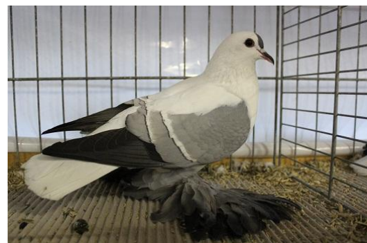
Saxon Silesian Swallow blue white bars Michael Gallasch, V 97 SVB