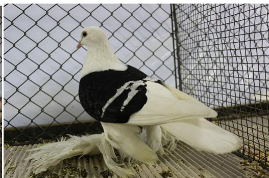
Saxon Shield black white bars Steffen Grund, V 97 SVB