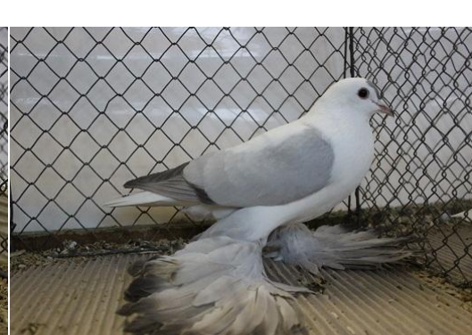
Saxon Silesian Swallow silver barless Daniel Klemm, V 97 SVB