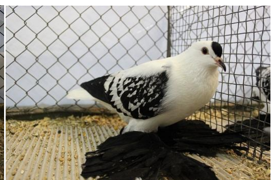
Saxon Silesian Swallow black spangled Gert Melzer, sg 95 E