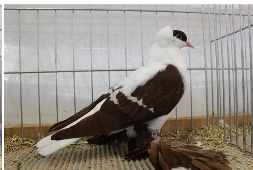
Saxon Fullhead red white bars Klaus Hentschel, sg95 EP