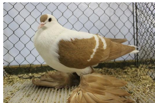
Saxon Silesian Swallow yellow white bars Heinz Mosig, sg 95 E