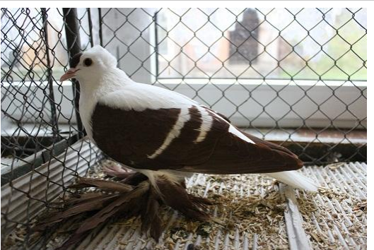
Saxon Fairy Swallow red white bars Kurt Melzer, V 97 SVB